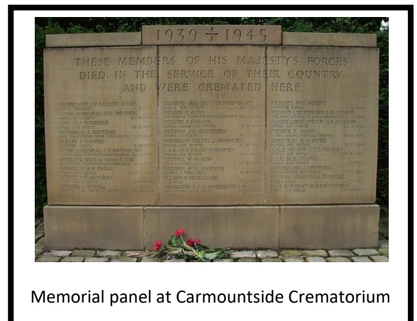
Memorial panel at Carmountside Crematorium